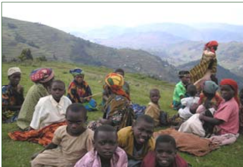
Community meeting, Murubindi, Uganda.

The Bwindi, Mgahinga and Echuya forests in south-western Uganda were gazetted as forest reserves by the British in the 1930s. This effectively protected them from being destroyed by the agriculturalists who had moved into the area formerly inhabited only by the Batwa, while allowing the Batwa to continue to make use of them. However, since Bwindi and Mgahinga became national parks in 1991, Batwa exclusion has been