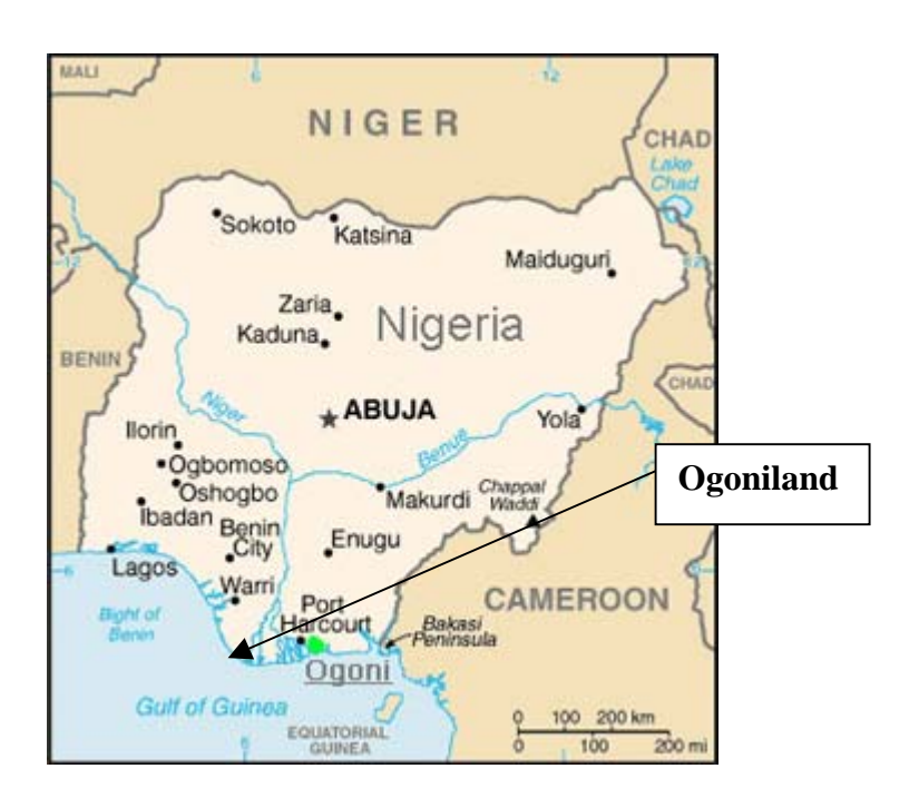
Figure 1. Ogoniland in the Niger River Delta of Nigeria.

forest is almost completely loss as most of it has been cleared to create farm land. The Ogoni are one of the many indigenous groups inhabiting the Niger River Delta of Nigeria. They came to this location some 500 years ago and settled in six kingdoms, namely: Babbe, Eleme, Gokana, Ken-Khna, Nyo-Khana, and Tai. Though settled in separate kingdoms, the peoples are culturally the same, hence their common identity, the Ogoni peoples.